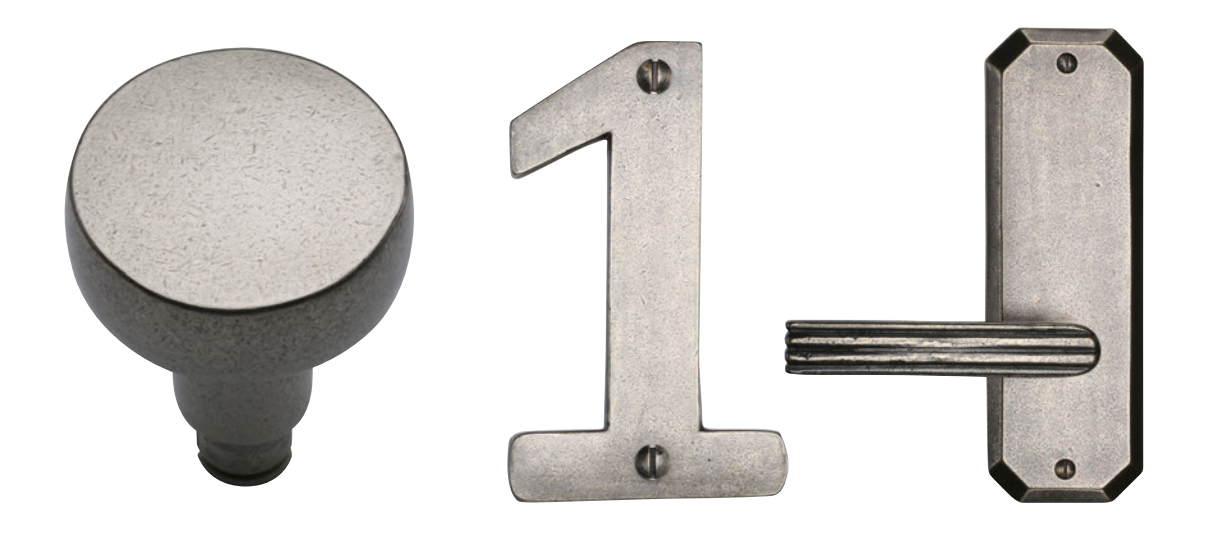
Left: Helios (880) Knob in White Medium patina; Middle: Surface Mounted Contemporary Numeral in White Medium patina; Right: AL Escutcheon with Adonis Lever (985) in White Medium patina

The White Medium patina is hand-applied to each art-grade bronze piece. As the metal oxidizes, the natural white color undergoes a transformation to a pewter-like patina. Due to minute fluctuations in temperature or humidity, each batch varies ever so slightly. Combined with the unique sand casting process of each individual piece, this enhances the one-of-a-kind look of each element. And since the finish oxidizes gracefully rather than corroding (like lacquer products, which face finish failure), White Medium finished elements are suitable for exterior use.