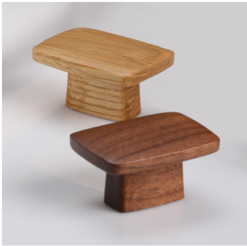
Ashley Norton's Rectangular Knobs in Oak (top) and Walnut (bottom) finishes

"A fresh alternative to shiny metals, wood adds a warmth that few other materials can replicate," Karnani adds, noting that natural materials such as wood and stone are trending as today's designs go back to basics.